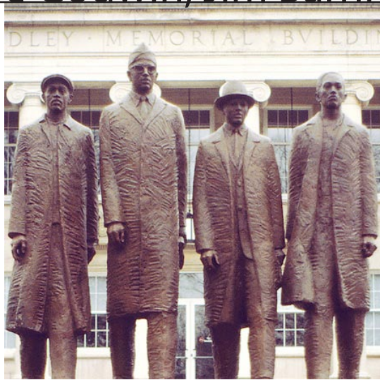
February One Bronze, 2002, 10'x10'x3' NC A&T, Greensboro NC