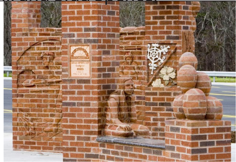
To Build a Community Brick, 2006 Greensboro NC