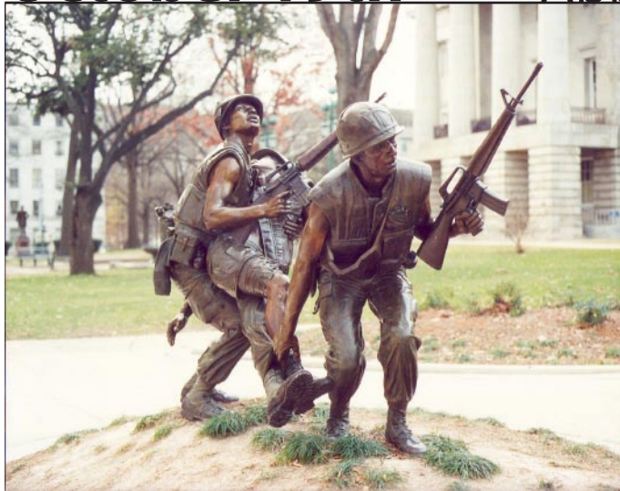
After the Firefight , North Carolina Vietnam Veterans Memorial Three 6-7' cast bronze figures of servicemen, c. 1982 Union Capital Square, Raleigh, N.C.