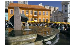
Anita Garibaldi Square

No online registration is accepted. Checks are made payable to UNCG