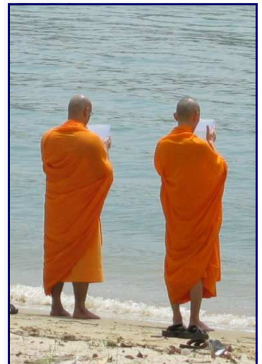
Monks on the beach during his semester in China

For more stories from Bryan students who have studied abroad, please go to www.uncg.edu/bae/studentser/studyabroad/ .