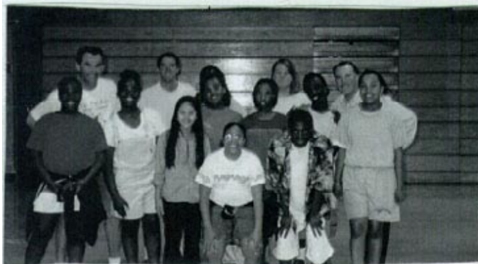
Jackson Middle School Sports Club