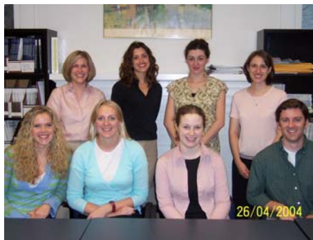
Class of 2004