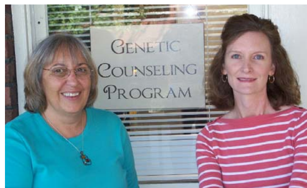
Our new sign— a gift from the class of 2010

The program continues to attract a large number of qualified applicants, a growing number of whom tell us of contacts they have had with program alumni through shadowing or internship experiences.