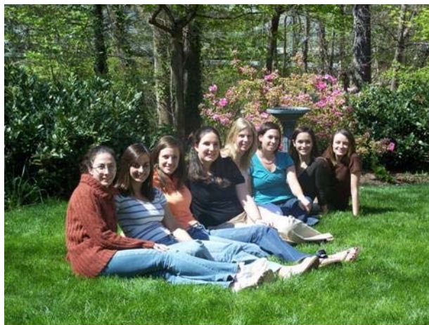
Class of 2008