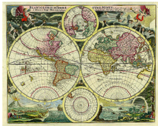
Map by Weigel, 1740

Final Paper/Project due – my office by 6 P.M.