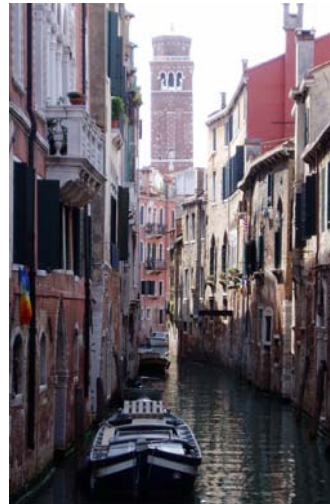
Landscape & Architecture: Stephanie Jones, Canal, Italy