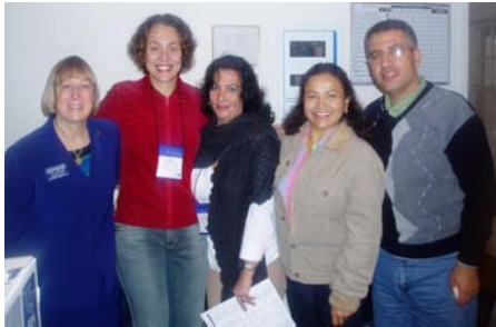
OSEAS advisors before regional NAFSA