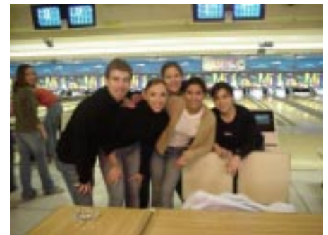
International Students at the bowling alley

Department of Homeland Security (DHS) eases some special registration requirements. On December 2, 2003, the Department of Homeland Security (DHS) published a rule that amends several requirements associated with the Special Registration program. Under the new rule, individuals subject to Special Registration are still subject to departure controls that require them to use only designated ports of departure when departing the U.S., but they are no longer subject to the requirement to report to DHS offices between entry and departure (the so-called 30-day and annual re-registrations). The rule also provides that F, M, and J non-immigrants who report changes in address and educational institution as required through SEVIS are no longer required to report those changes using Form AR-11SR. The changes to Special Registration are effective immediately [69 Fed. Reg. 67578 (December 2, 2003)].