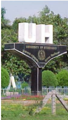
University of Hyderabad, India

For more than ten years, UNCG has built its international reputation on its more than 40 exchange partnerships. In recent years, more and more students, as well as educators, have begun to realize that an international experience should be an integral part of every degree program. With the ever-increasing student interest in studying abroad comes a greater need for a broader, more diverse offering of countries and curricula. To that end, IPC is thrilled to announce the addition of several exciting programs in Eurasia: University of Hyderabad, India; Yeditepe University, Turkey; Kazan University, Russia; and Chinese University of Hong Kong, China.