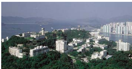
Chinese University of Hong Kong, China