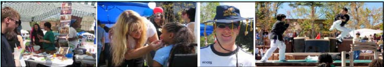
*Sample Performances, Demonstrations and Organizations

The largest international cultural event at the University of North Carolina Greensboro, the UNCG International Festival (I-Fest), offers traditional dance, music, culinary delights, and customs from around the world. Interact with international students and scholars as they showcase dress, artifacts, games and other activities from their countries. Don't miss the new children's international area, flag face painting, the popular passports-around-the-world, and the cultural performance stage. This event is free and open to the public. The I-Fest begins at noon on Saturday, April 12 around the UNCG Dining Hall fountain area.