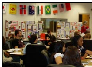
Students Participate in Workshop