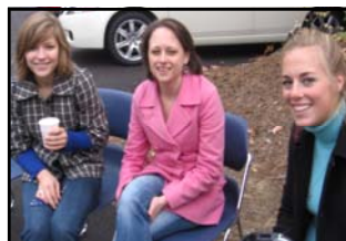
Outgoing Study Abroad Students