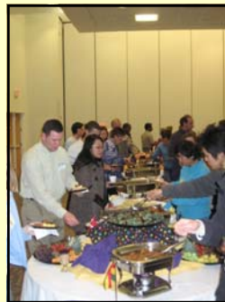
New and returning students enjoying the Reception