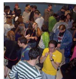
Friday Fest Spain

*Subject to Change, updates are on the web