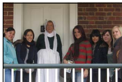
International Students enjoy Old-Salem

To the Downtown Arts District of Winston-Salem, where they finally settled on dining at the Sweet Potato Restaurant. There they tasted fine southern cuisine - from fried chicken to meatloaf, grits to sweet potatoes and friend green tomatoes to okra. The coffee shop next door provided a comfy place to digest until show time. The final leg of the journey was to the North Carolina School of the Arts to take in a play called “Bus Stop”. Despite a mix up in locations, the group made a successful sprint to the performance center. Many agreed the play was the best part of the evening. Others enjoyed the time travel earlier that day. Either way, a good time was had by all.