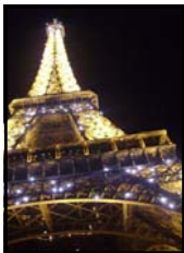
Eiffel Tower, Paris

I also went to Paris and it was everything I had imagined. The best thing I did was walk for fifty minutes from the Louvre to Notre Dame. While both places were alarmingly beautiful on the inside, the walk was rejuvenating and effortlessly charming. Men sat with their paintings, trying to make money by the large flowing river. The buildings and the street lights, budding with flowers in pots, vines dripping down, cast shadows on the streets and people. There was the smell of roasting chestnuts sold by little smiling boys, and the occasional dark alleyway where the sun doesn't quite reach and makes you feel alive to just step back into the warmth of the sun.