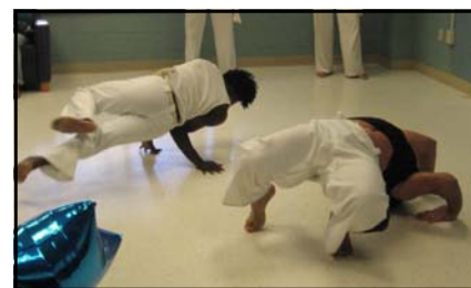
The Brazilian Cultural Center demonstrates the art of Capoeira: a type of Martial Arts