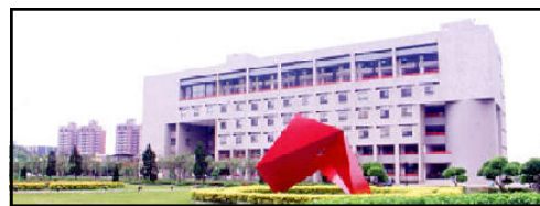
Yuan Ze University

During the Group Study Exchange, I will visit several Taiwanese universities (including Yuan Ze, a partner school). My main objective is to learn more about the role of international education in Taiwanese higher education systems and to uncover the contemporary issues and opportunities facing administration and programming. My adventure will begin on March 22 and I am excited about my upcoming journey!