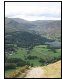
The Peak District, UK

Outside of this city there are more cities, stretches of road lined with trees, connected houses, sheep, and lots of big buses and little cars. In Newcastle, after a six hour bus ride, I saw Hadrian's wall at its finest. We went to a stretch of beach that is called South Shields, Black Gate, with little museums. A quick car ride takes you to the largest mountains in Great Britain and straight into the beautiful wide open sky. I climbed to the top of one of the mountains and found a crystal clear lake teeming with fish!