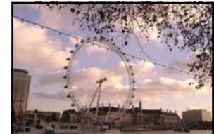
The London Eye, UK

I traveled to London and visited the National Gallery. It was so stunning that people just stood and stared and I couldn't help but do the same. The metro in London is a piece of cake and you can zip on and off. You can get a Metro card for barely nothing and see everything. I stumbled upon Westminster Abbey in pursuit of a ferry ride up the river. Easy and free to see!