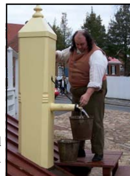
Man Pumping Water From Old Well