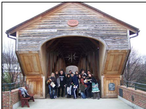
The Adventurous International students at Old-Salem Gate