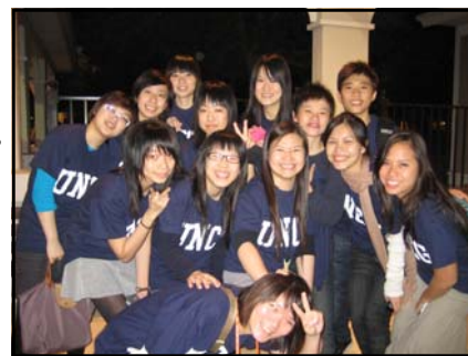
New Disney Students Arrive