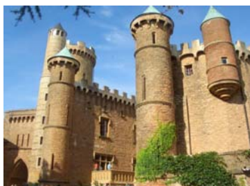
Château d'If, the historic location for the Count of Monte Cristo

Bonjour!! I would like to start by saying that I am having the best time of my life in Lyon, France, and that I eagerly recommend that students study abroad! There are so many reasons to participate in such a life changing process, but for me the opportunity to learn a different language and a different culture is reason enough.