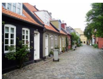
One of the quaint side streets in Aarhus, Denmark

“Tak! God pinse!” I said to my Danish colleagues on my way out the door at Aarhus School of Business (ASB). Forty-eight hours prior to that moment I had never been to Scandinavia, nor did I speak a single word of Danish. I was very excited when I found out that I'd be able to visit some of UNCG's partner universities this summer, but I had no idea what adventures Denmark had in store for me.