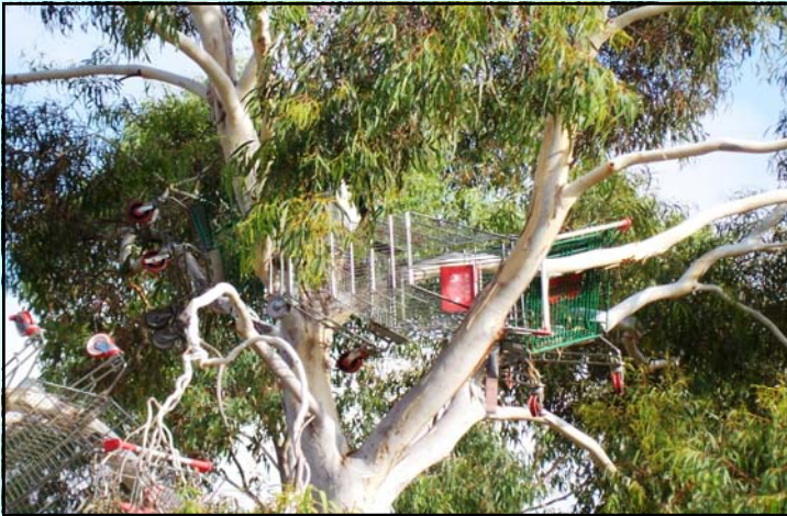
Trolley Tree, Canberra, Australia

My favorite picture from my time in Canberra, Australia, is of the “trolley tree”. The dorms, “the rezies” as they call it, are within walking distance of the mall and grocery market. Rules about shopping carts and bags and receipts are very different here: you push the same cart from store to store and purchases are not