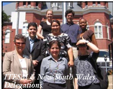
ITESM & New South Wales Delegations