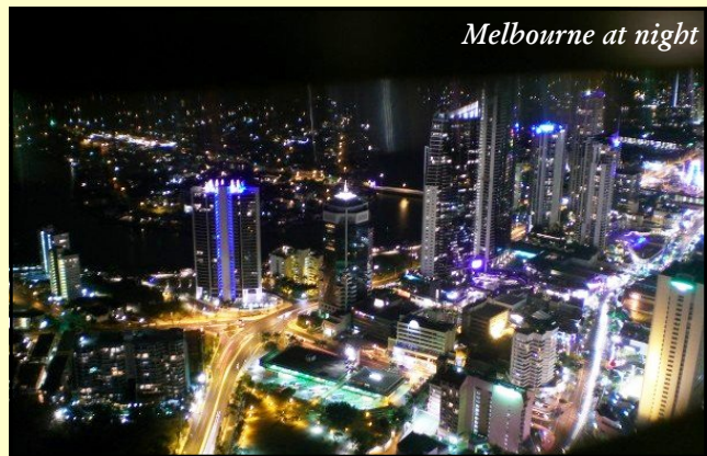
Melbourne at night