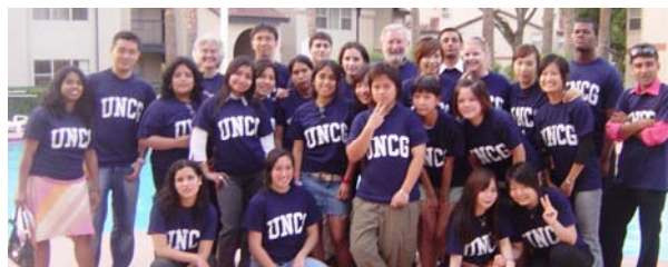
UNCG's Disney International College Program Participants