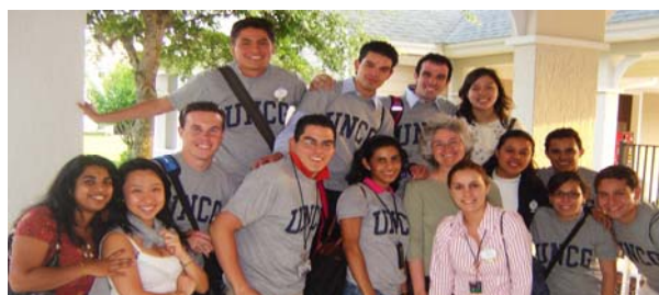
UNCG's Disney International College Program Participants