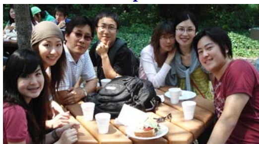
Graduated INTERLINK students!