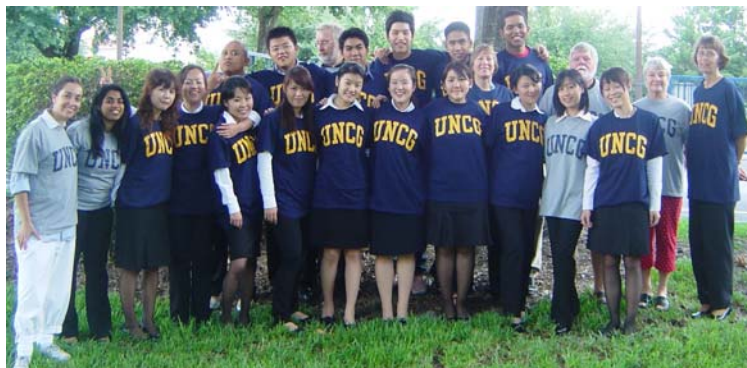
UNCG's Disney International College Program Participants